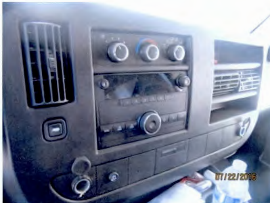
Document Name: INSTRUMENTPANEL.jpg