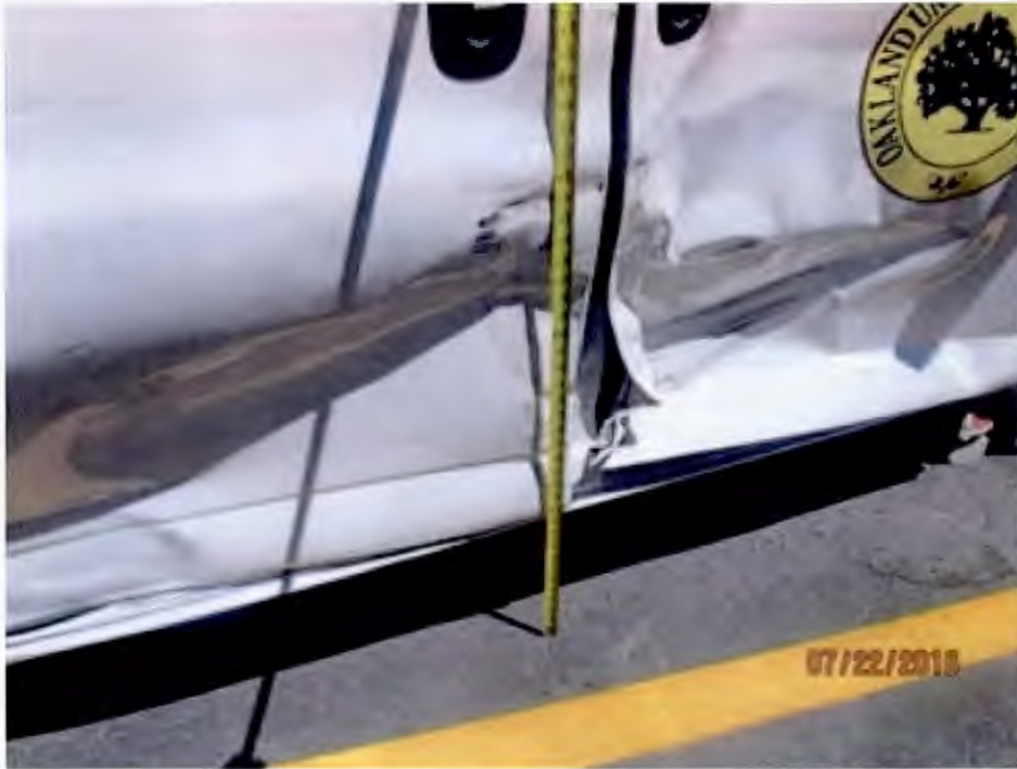
Document Name: 133.jpg Remarks: MEASUREMENT