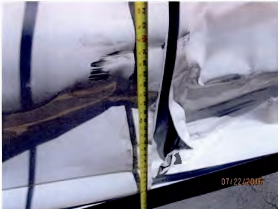
Document Name: 134.jpg Remarks: CLOSE UP