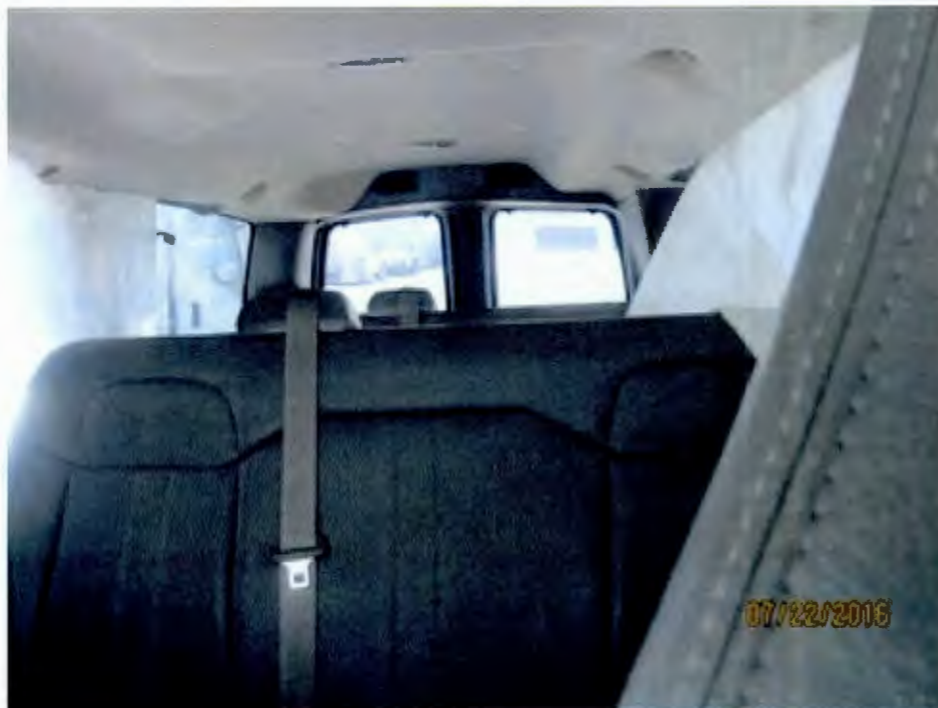
Document Name: SEAT.jpg