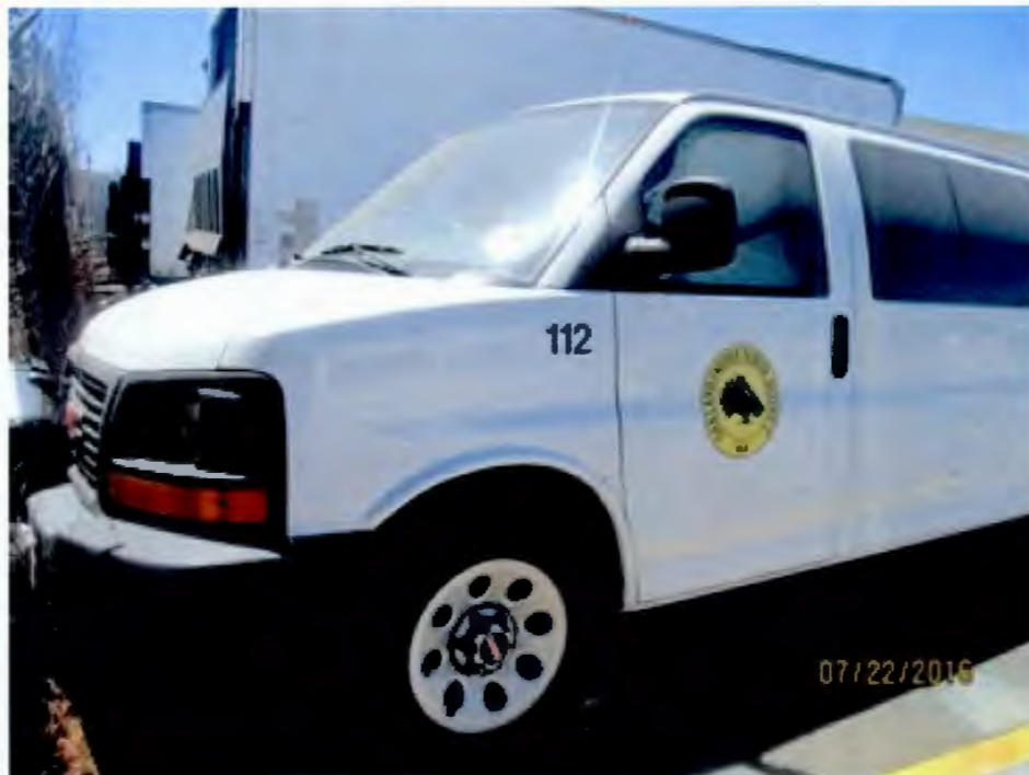
Document Name: LEFTFRONT.jpg