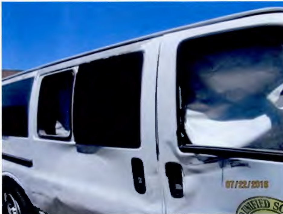
Document Name: 130.jpg