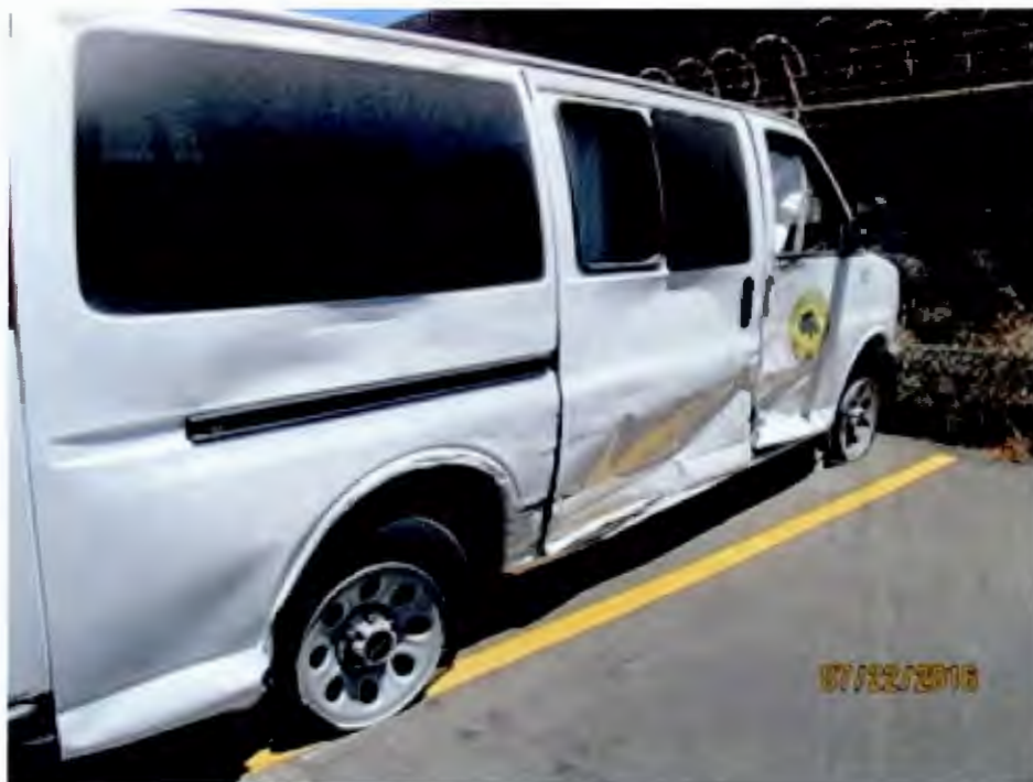
Document Name: 126.jpg Remarks: DMG RT SIDE