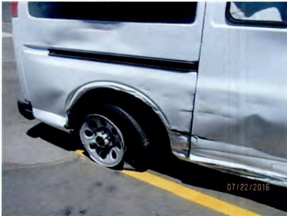
Document Name: 132.jpg Remarks: DMG SUSPENSION