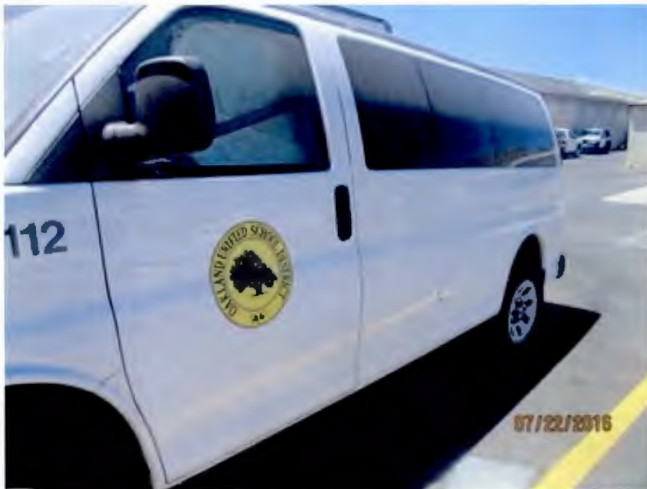
Document Name: 139.jpg Remarks: LT SIDE