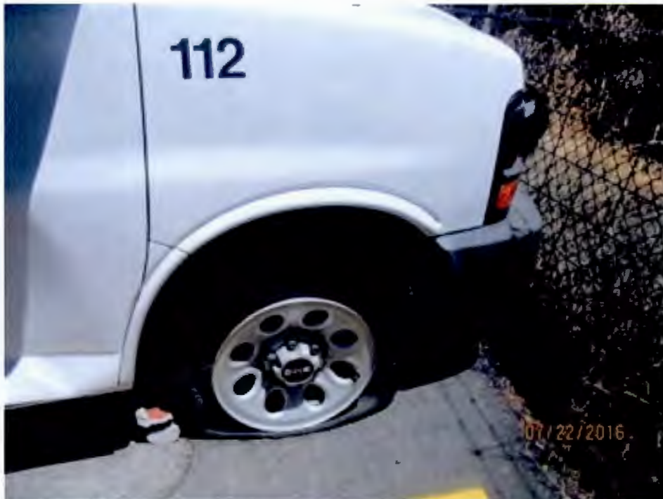
Document Name: RIGHTFRONT.jpg