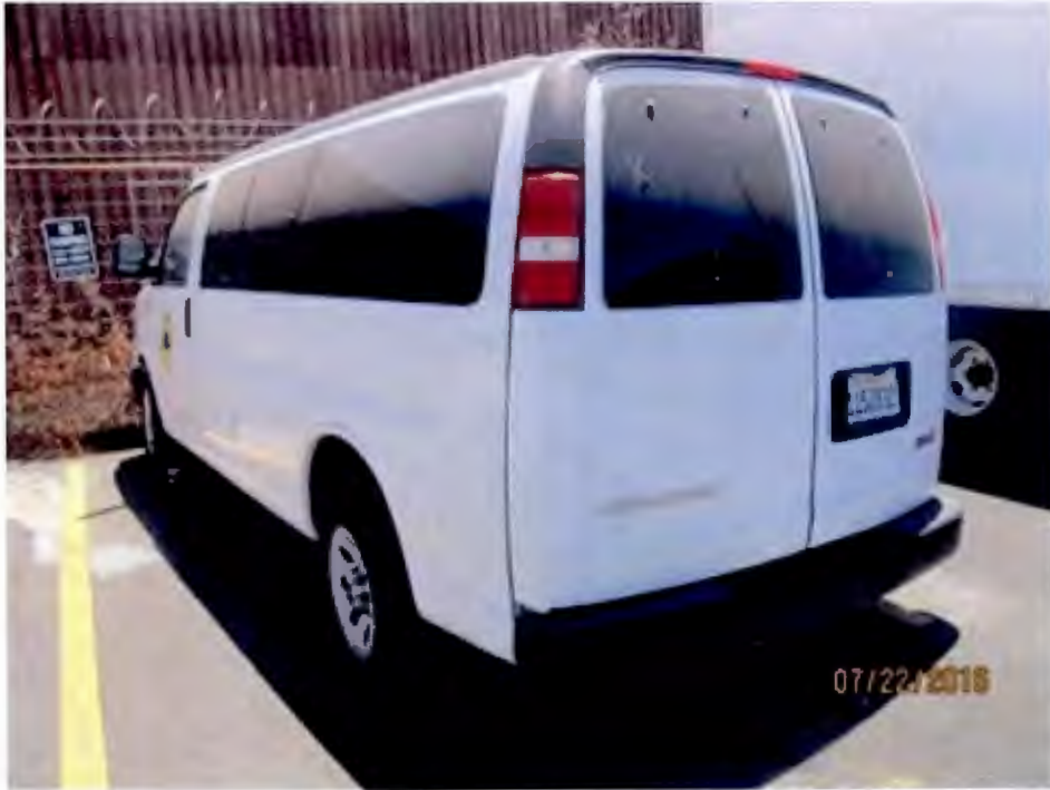
Document Name: LEFTREAR.jpg