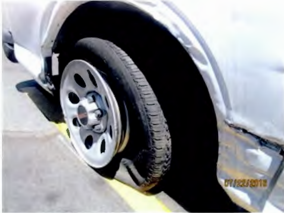
Document Name: 136.jpg Remarks: SUSPENSION