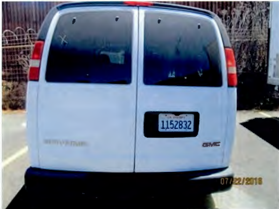
Document Name: 123.jpg Remarks: REAR