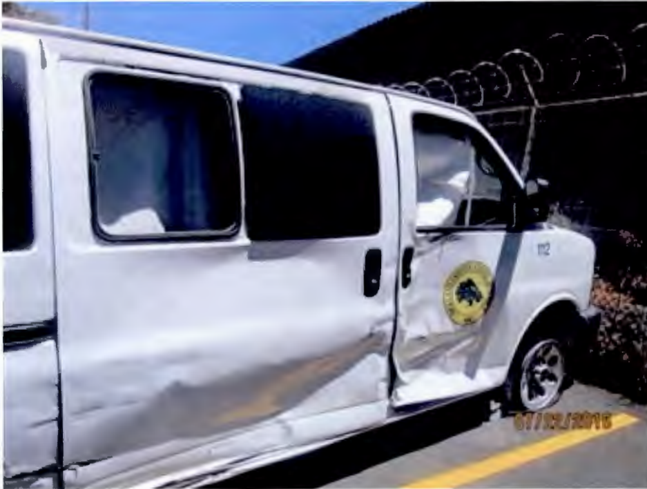
Document Name: 128.jpg