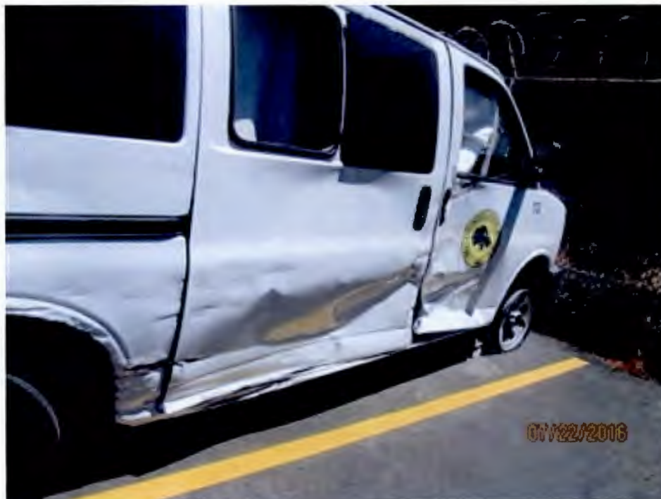
Document Name: 135.jpg Remarks: RT SIDE