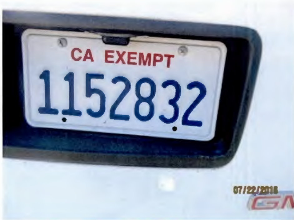
Document Name: LICENSE.jpg