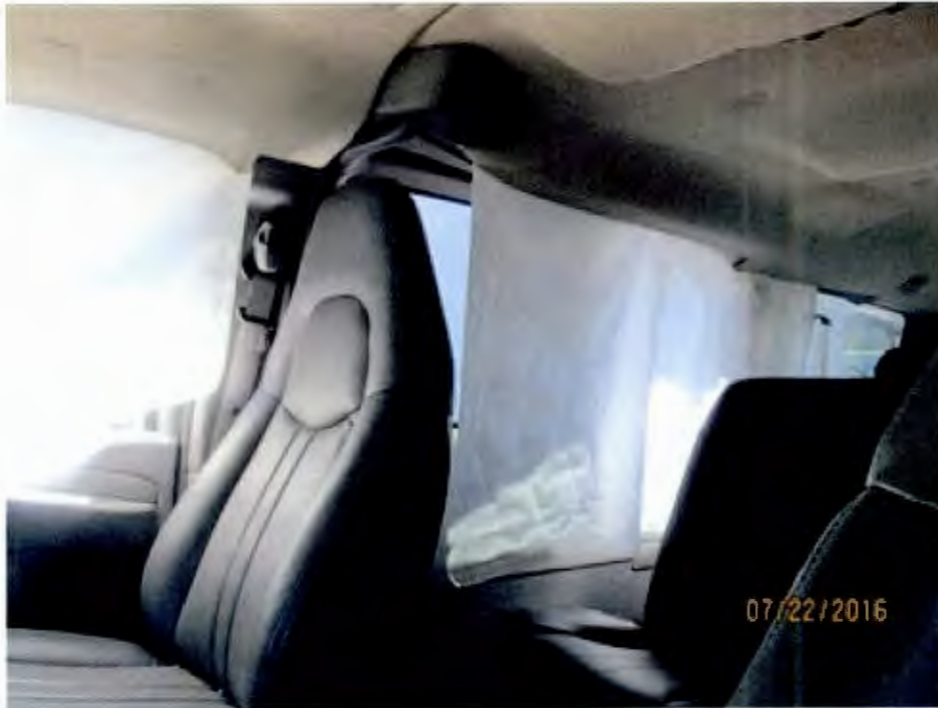
Document Name: INTERIOR.jpg