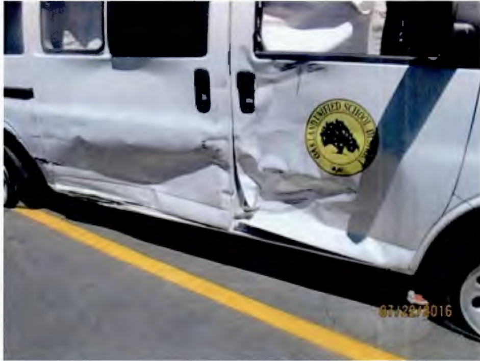
Document Name: 131.jpg Remarks: ANOTHER VIEW