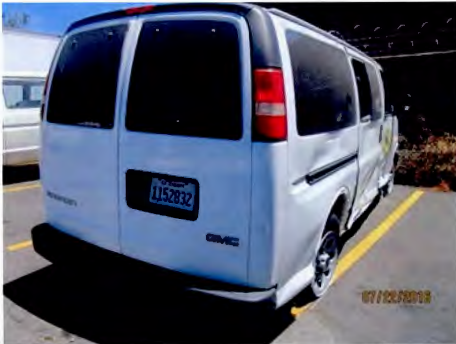
Document Name: RIGHTREAR.jpg