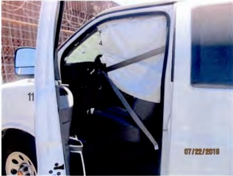
Document Name: BAGS.jpg