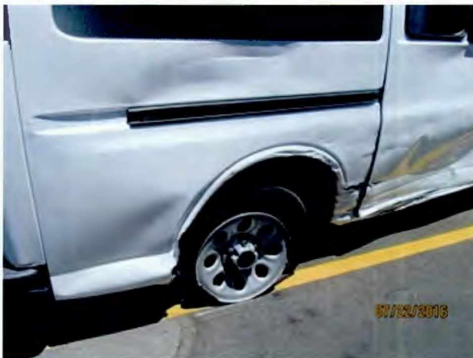
Document Name: 127.jpg Remarks: DMG RT SIDE