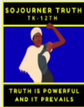
Sojourner Truth Virtual Academy (Independent Study Program)