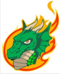
Dewey Academy (Continuation School)