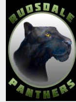
Rudsdale High School (Continuation School)