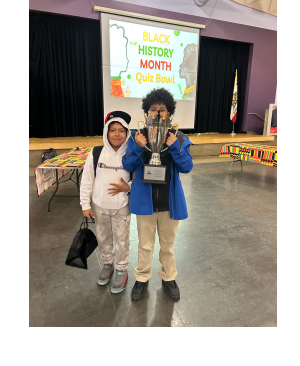
Black History Month Quiz Bowl Champions

me preguntan quien soy, soy magia. i am living dreams. star dust and flower petals. yo soy todo lo que esta, entre la miel y el fuego.