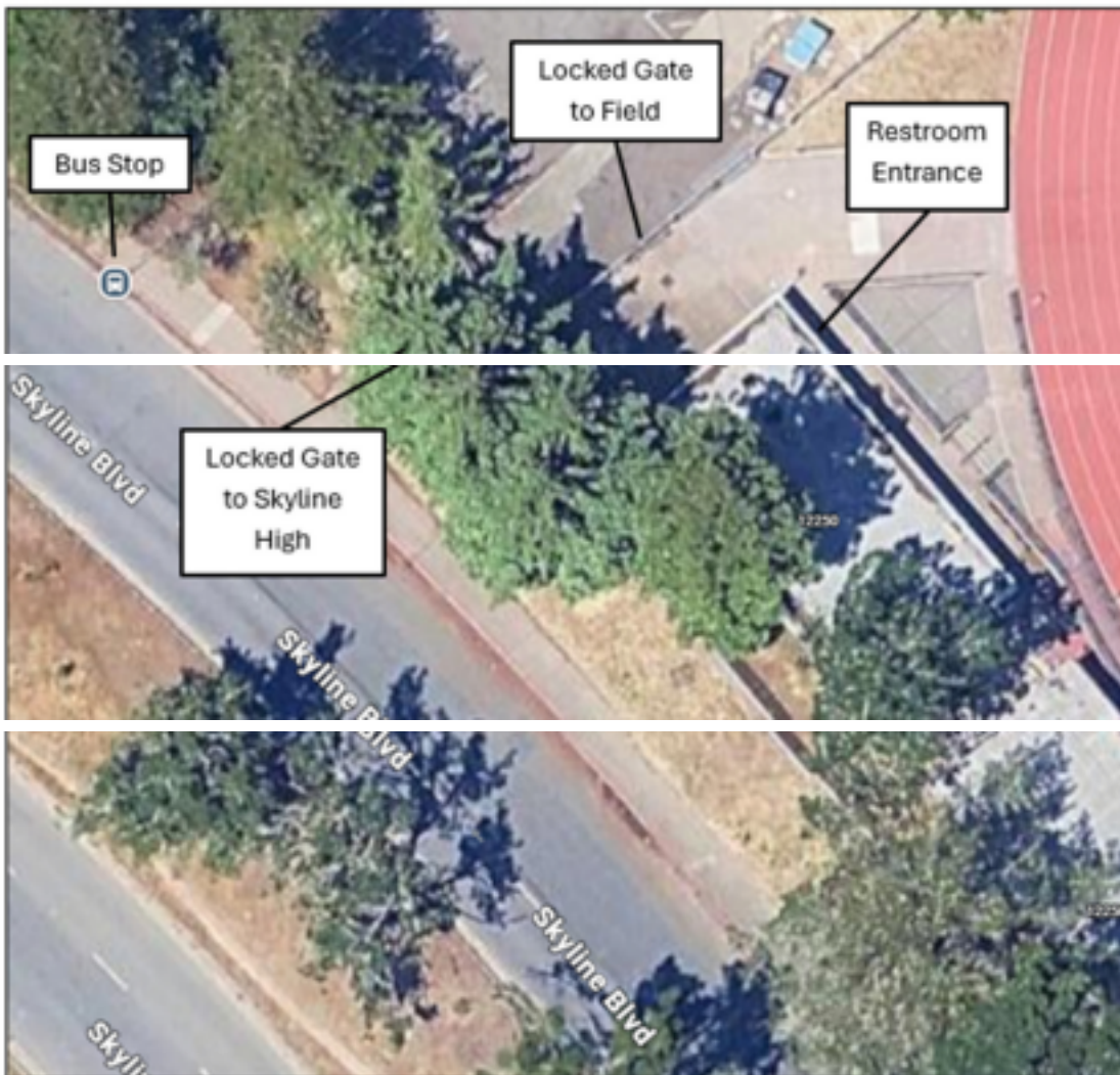
Exhibit A- Location of Restroom