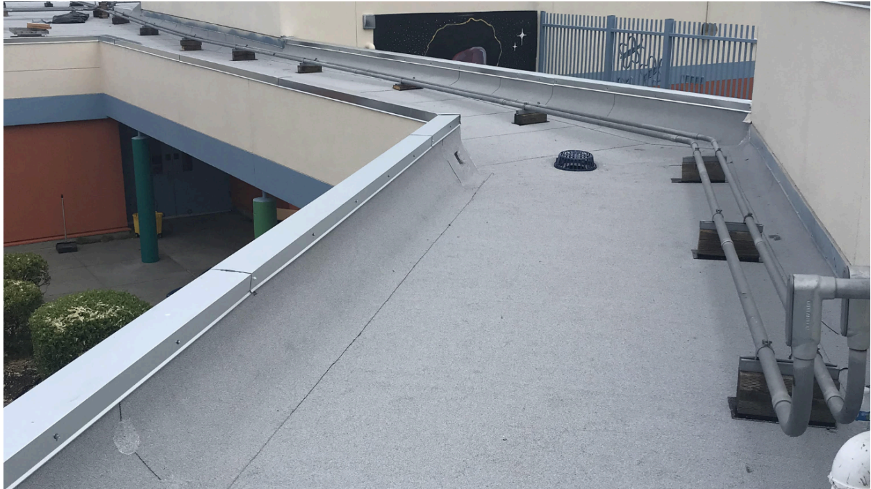
FloWater Installation District wide