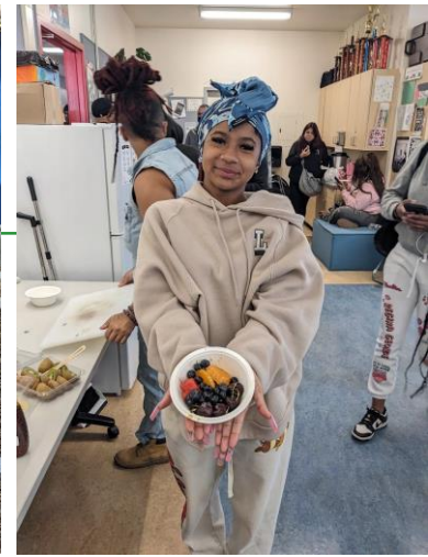
Gardening, making herbal tea, & learning about seasonal produce with Growing Together