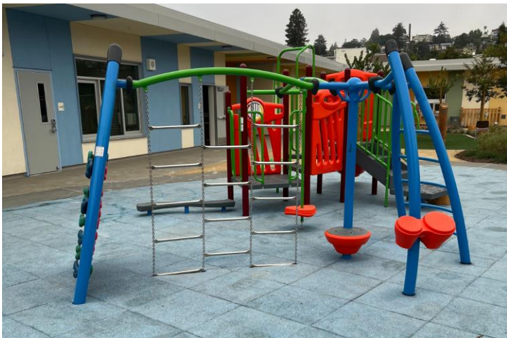
New play structure (associated support space)

There is nothing to report at this time.