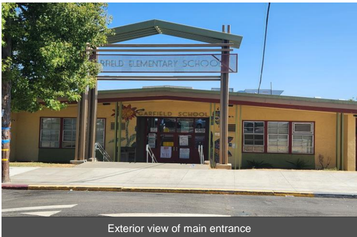
Exterior view of main entrance