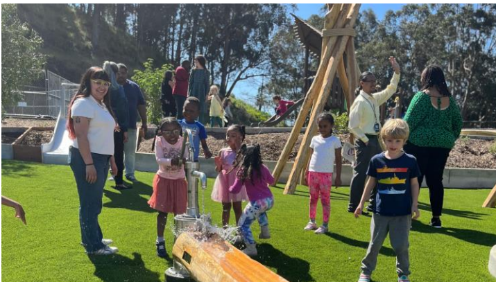
Students playing in the outdoor living play area at ribbon cutting ceremony.

There is nothing to report at this time.