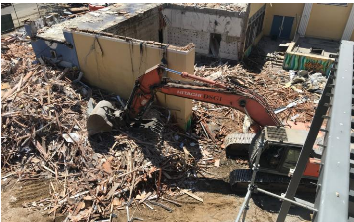
Demolition of old building

There is nothing to report at this time.