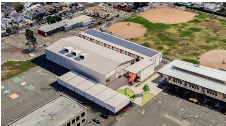
Proposed aerial perspective