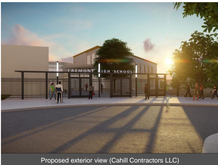
Proposed exterior view (Cahill Contractors LLC)

There is nothing to report at this time.