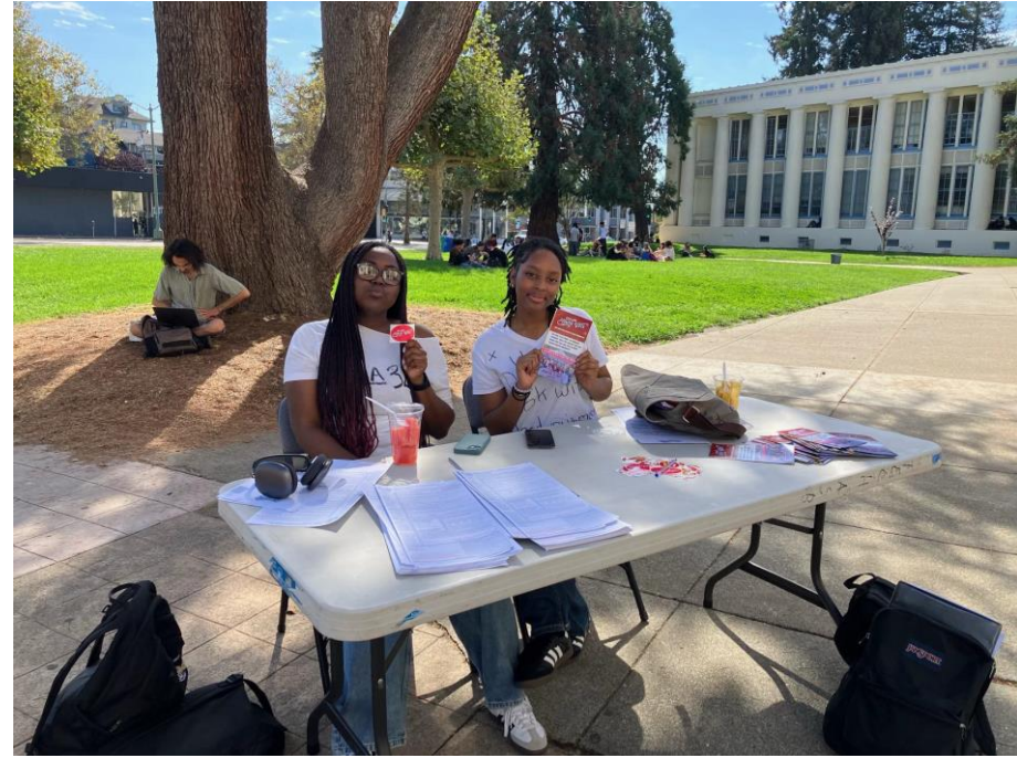
CLC students tabling at UC Berkeley (right) and Oakland Tech (left).