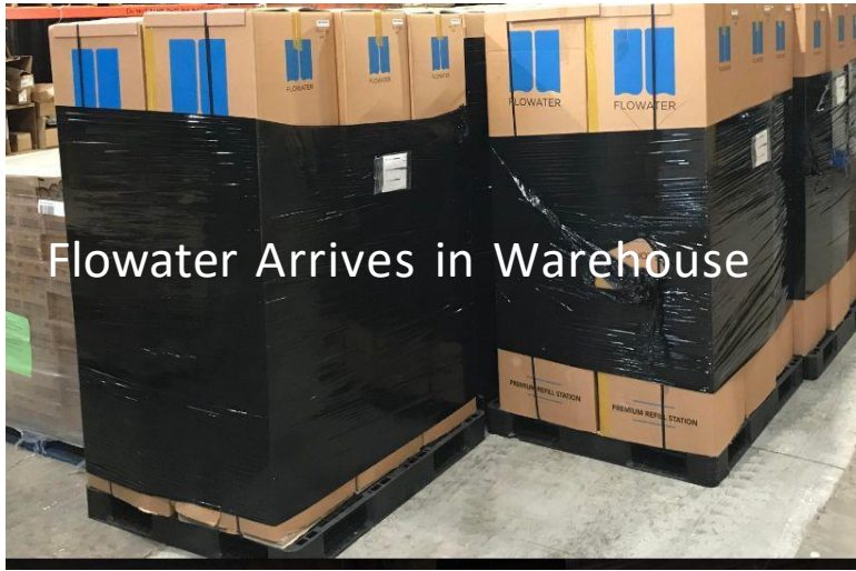
Flowater Arrives in Warehouse