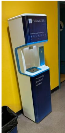
2nd Flowater Unit Installed at Cleveland Elementary