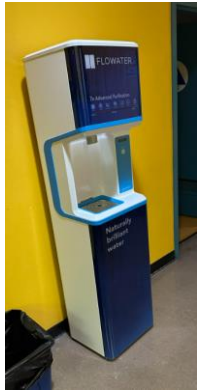
2nd Flowater Unit Installed at Cleveland Elementary