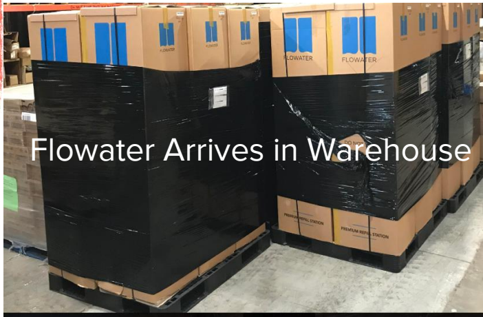
Flowater Arrives in Warehouse