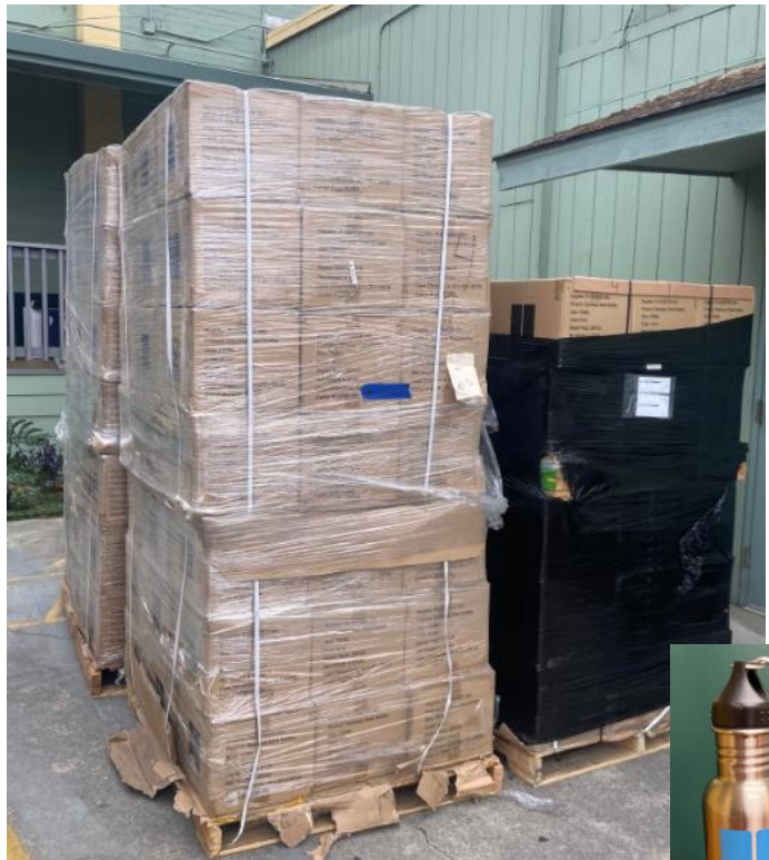
Refillable water bottles arrive for OUSD students