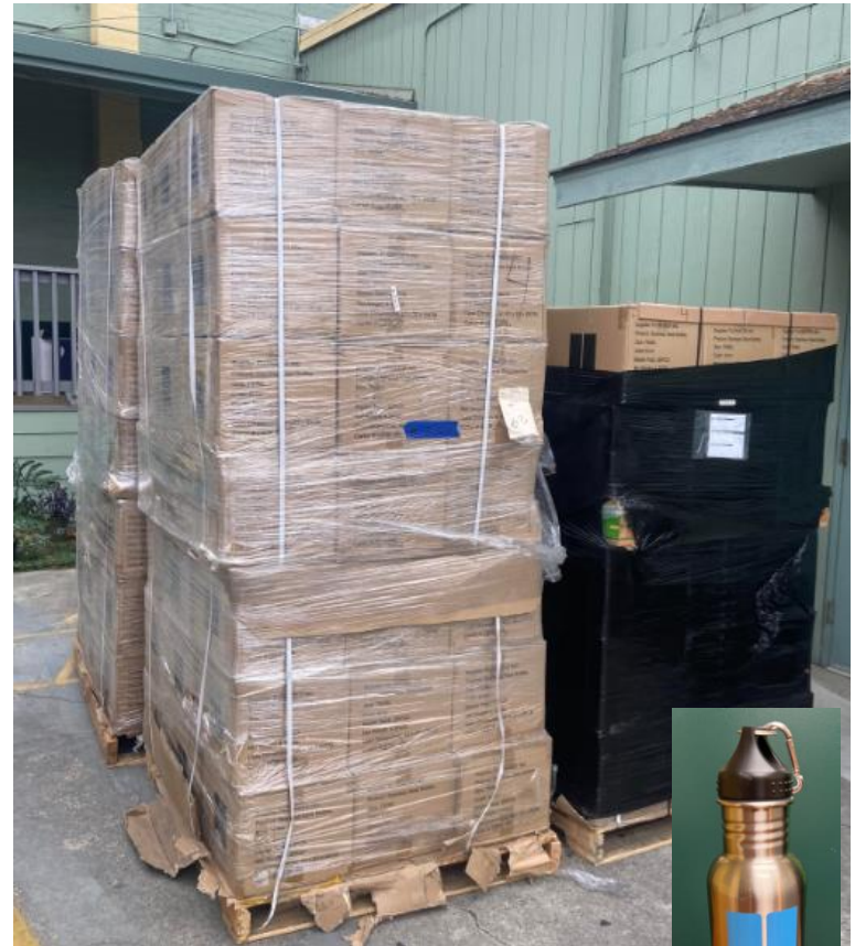
Refillable water bottles arrive for OUSD students