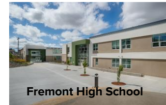
Fremont High School