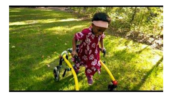
Innovating for an Accessible and Equitable World

This day has been observed internationally since 1992 and is one of many observances that value disabled people, their contributions to society, and current efforts to increase disability access and inclusion.