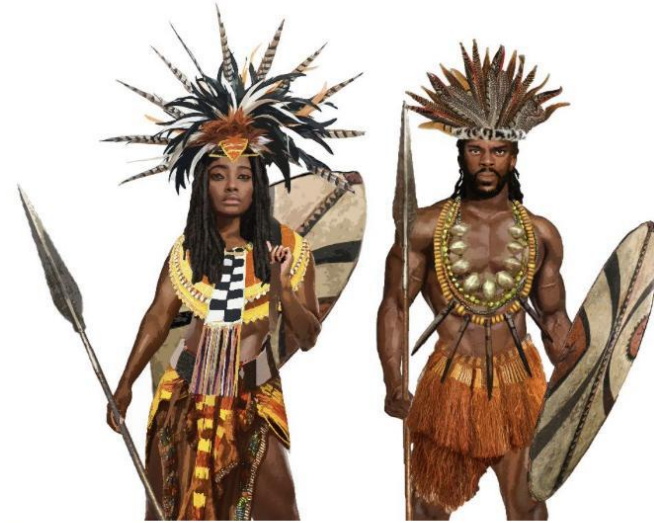
Anika Janell Photography