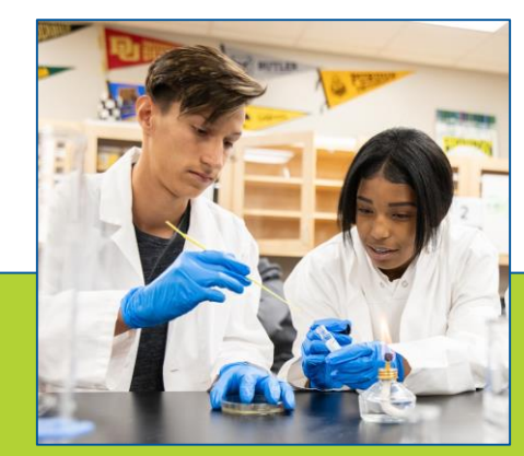
Goal 3: Increase College and Career Readiness:

A-G: 14.1% increase of students graduating A-G eligible since 2013-2014