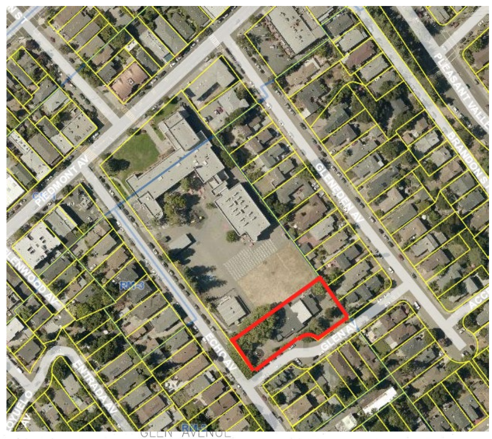
Exhibit A Description and Depiction of Piedmont Child and Development Center