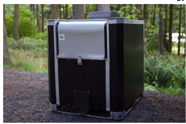
6 Bin Composting Structure

In Vessel Units - Green Mountain Technology Earth Cubes