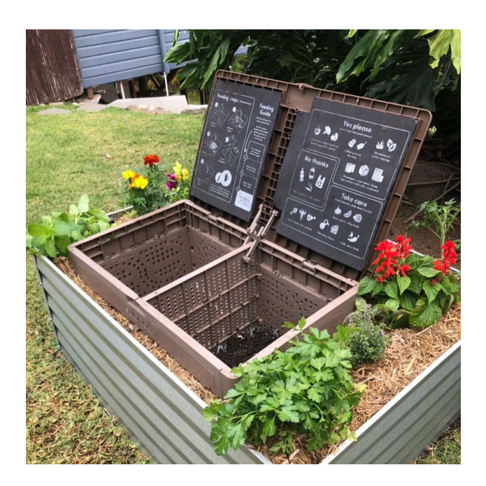
7 Day Worm Composting Beds