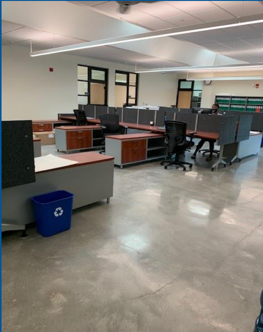
Open Office Area