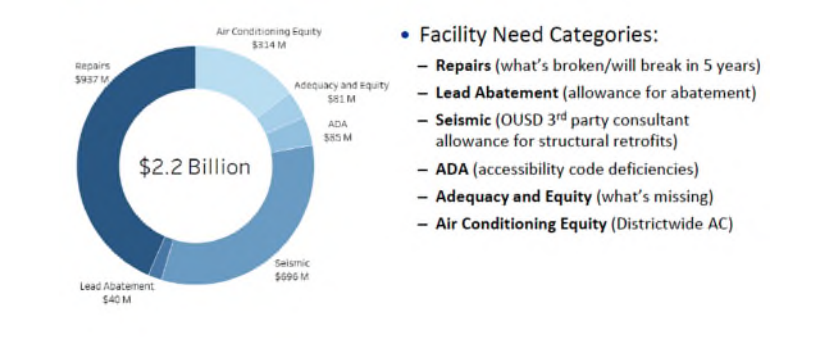
Fig. OUSD Projected Capital Projects

Charter Expansions: The proportion of students in charter schools in Oakland is much higher than the state average. In Oakland, in terms of enrollment, about 2/3 of students attend District-run schools and 1/3 of students attend charters schools. The Oakland charter sector has grown from approximately 1,000 students in 7 District-authorized charter schools in 1999 to its current level of 13,711 students in 34 District-authorized charter schools, plus another 2,948 students in 9 Alameda County-authorized charter schools (and 52 students in 1 state-authorized charter school).