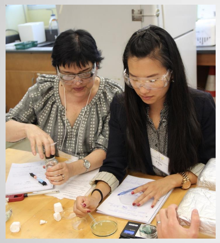
What to teach