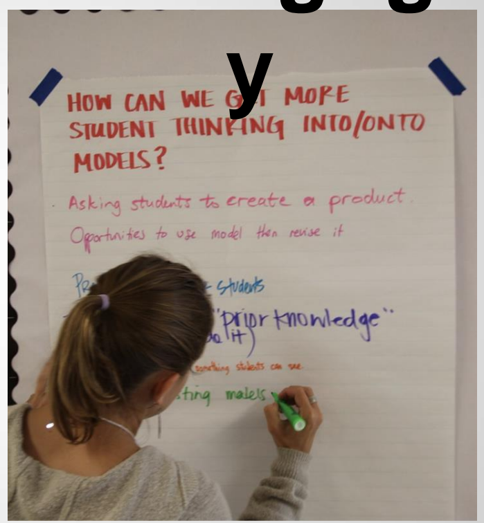
How to teach