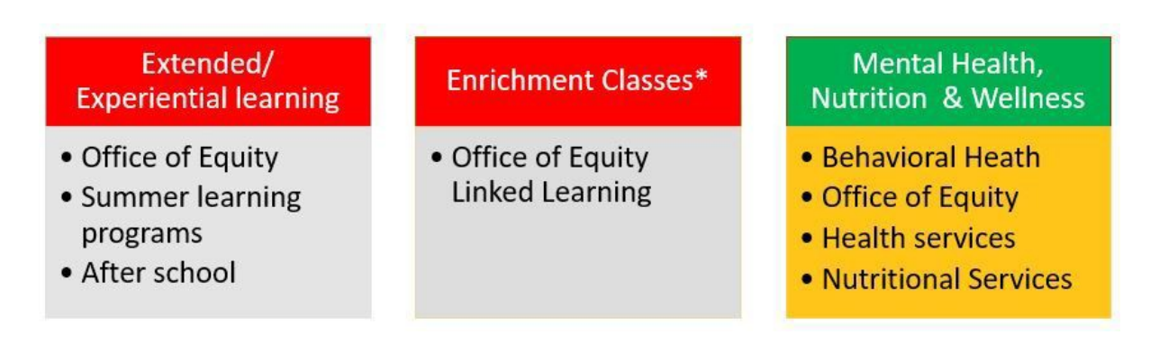
Figure 3: District departments that support student themes of Extended / Experiential Learning, Enrichment Classes* Mental Health & Wellness.

Figure 2: District departments that support student themes of Student Leadership, Family Engagement, Teacher Quality Relationships.