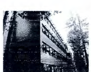
ICSC Biomedical Sciences Facility