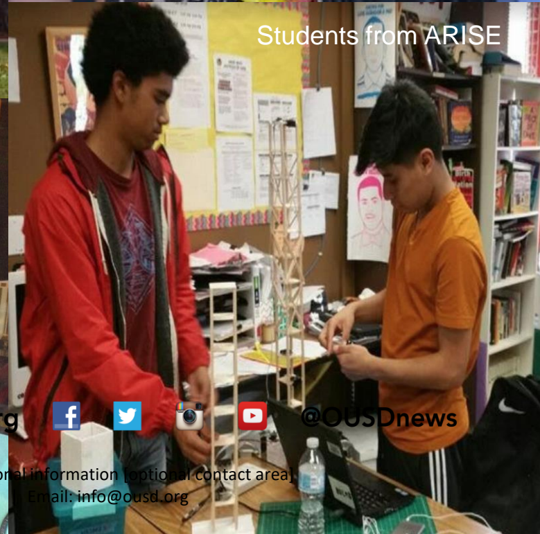
Students from ARISE