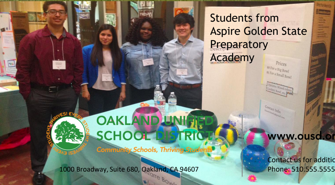
Students from Aspire Golden State Preparatory Academy