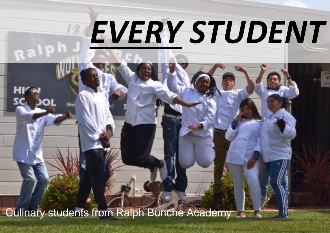
Culinary students from Ralph Bunche Academy