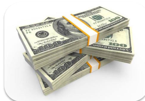
Revenue for OUSD