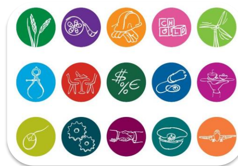
Career Technical Education