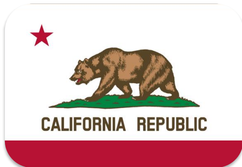
State Loan Relief