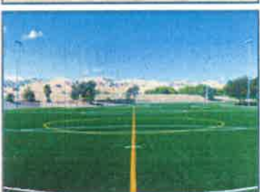
Antioch Park Antioch, CA