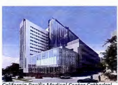
California Pacific Medical Center Cathedral Hill Medical Office Building