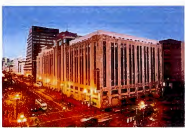
Market Square North

LECTURES "California Green Building Standards Code 2012: New Challenges and Opportunities" at the National Conference on Building Commissioning, May 2013; "California Green Building Standards Code 2012: Where are We Now?", California Women in Design + Construction, San Francisco, CA, October 2012.