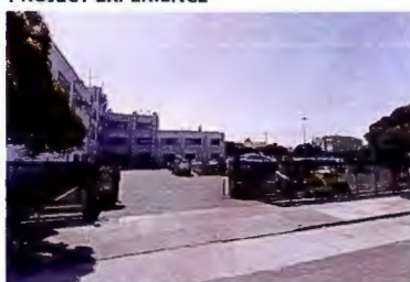
PG&E 2270 Folsom Service Center