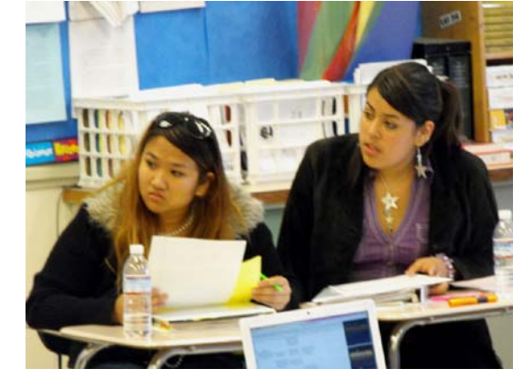
Working in teams, debaters conduct original research, crafting and advocating proposals on dozens of complex policy issues.

falling through the cracks in the traditional classroom, directing the strongest attention to students with behavioral problems and/or poor academic track records. Debate empowers students to take control of the learning process and, in so doing, engages students who might under-perform in a traditional classroom.