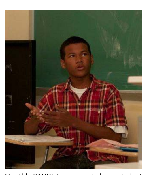
Monthly BAUDL tournaments bring students together for hours of intense argumentation, a culmination of practice and hard work.