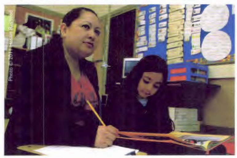
A recent FamELI meeting