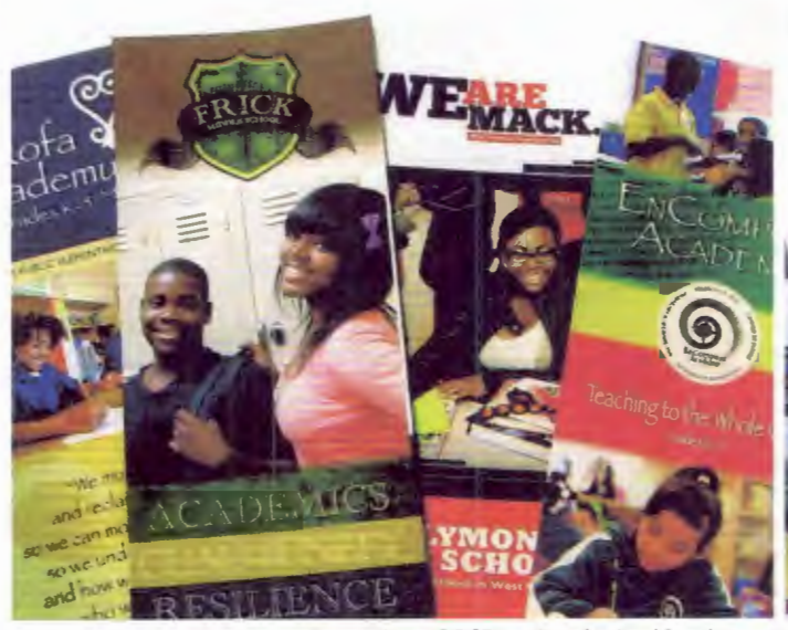
A sampling of OSF-produced school brochures