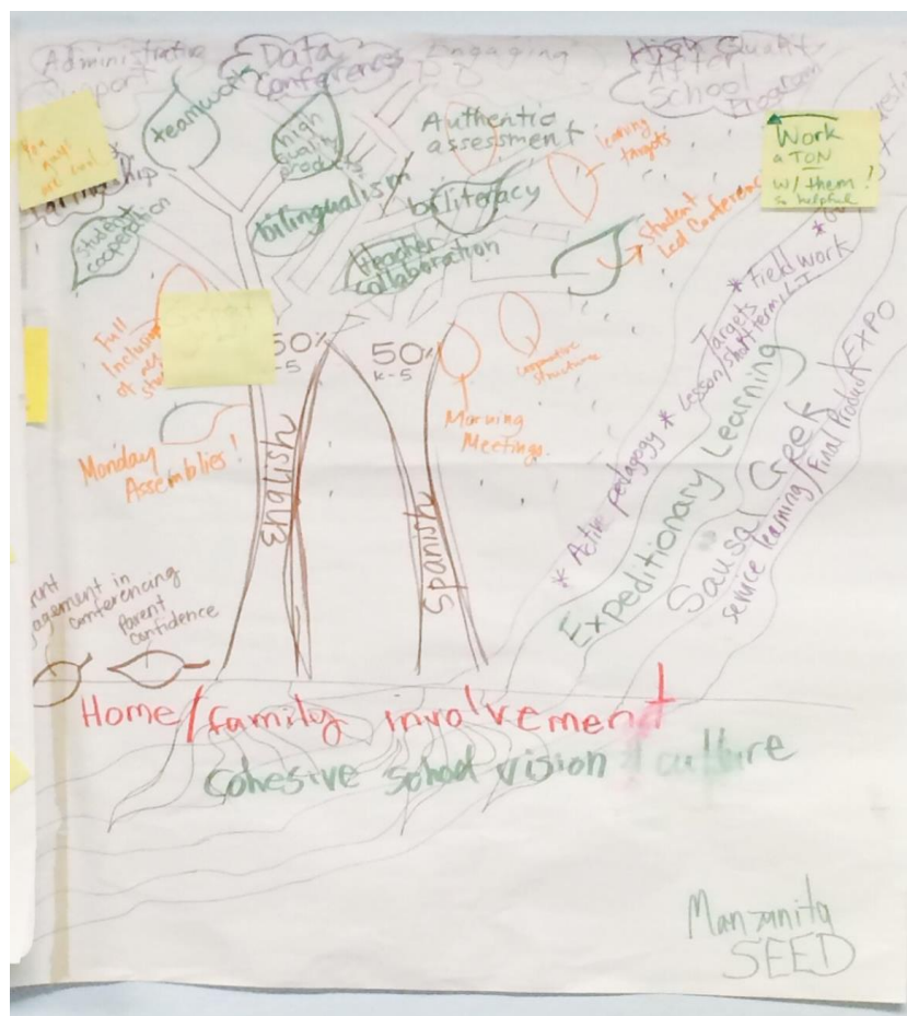
Pilar #4: Site-based decision-making in the areas of staffing, hiring, curriculum, budget, scheduling, and professional development