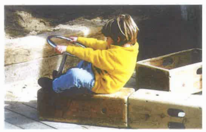
Laurel Hill Nursery School Play Yard, San Francisco