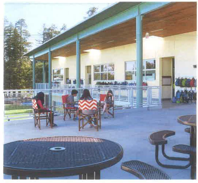
Fairmeadow Elementary School, Palo Alto Unified School District