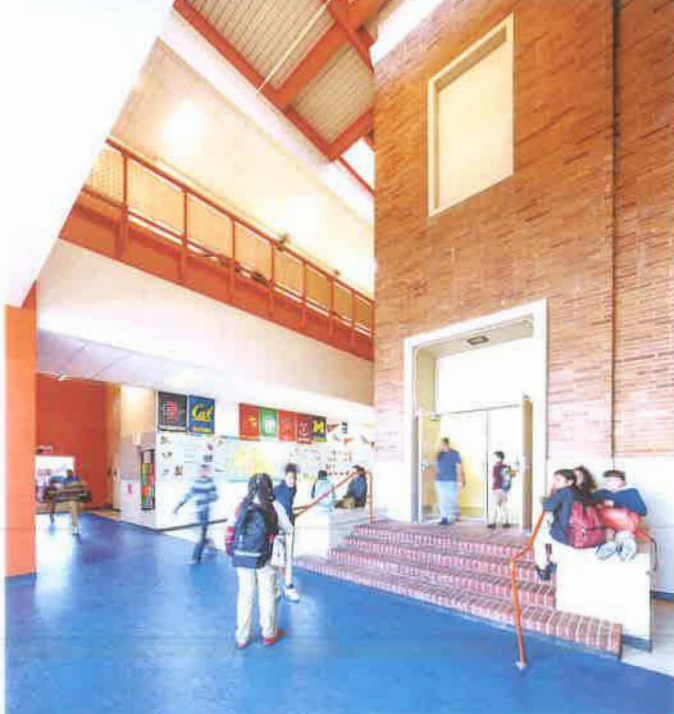
Greenleaf TK-8 School, CASH/AIA Califernia Honor Award, OUSD