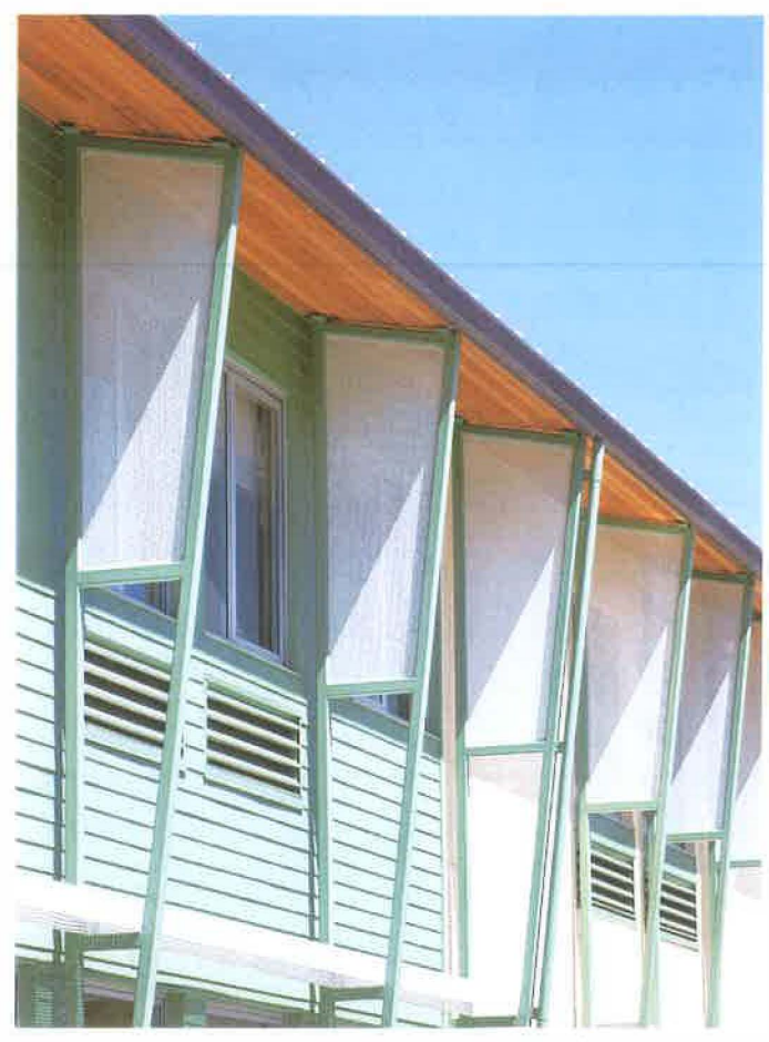
Ohlone Elementary School, Palo Alto Unified School District