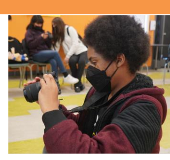
Presented to the Measure N Commission