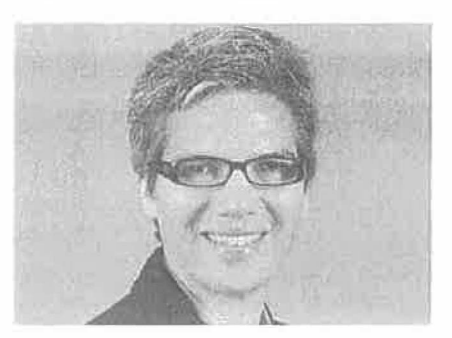
32 Years of Experience 32 Years with Sandis Professional Land Surveyor California #7756

OAKLAND UNIFIED SCHOOL DISTRICT SITE SURVEY SERVICES FOR KAISER ELEMENTARY SCHOOL SITE 1. DECEMBER 2021