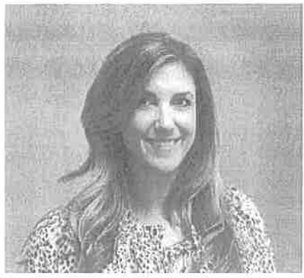
14 Years of Experience 3 Years with Sandis