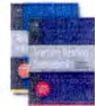
CORE Sourcebook Package* View Details