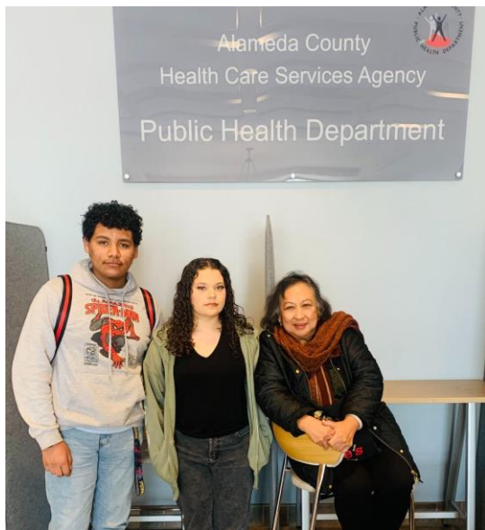
Alameda County Public Health Department