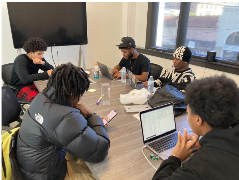
The Hidden Genius Project