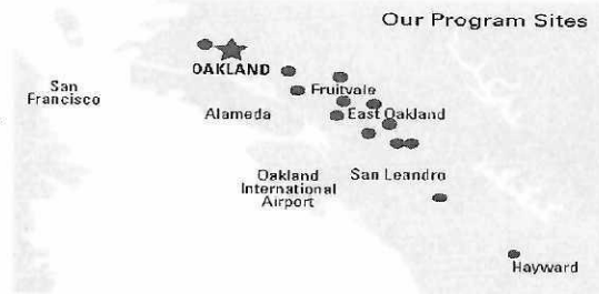
Our Program Sites