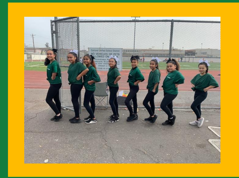
Middle School 1st cheerleading squad