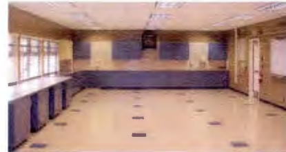
Classroom Lab, Madison Middle School