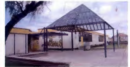
Madison Middle School Exterior