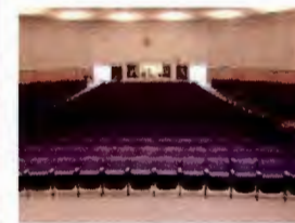
Castlemont High School Auditorium AFTER