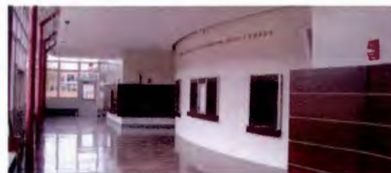
New Castlemont High School Performing Arts Center

New multipurpose building at Chabot Elementary School