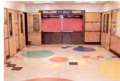
Bret Harte Hallway