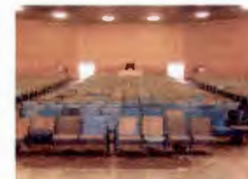
Castlemont High School Auditorium BEFORE