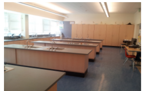
Lowell Science Classrooms