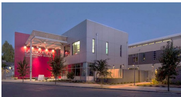
La Escuelita Educational Complex (LEEC)