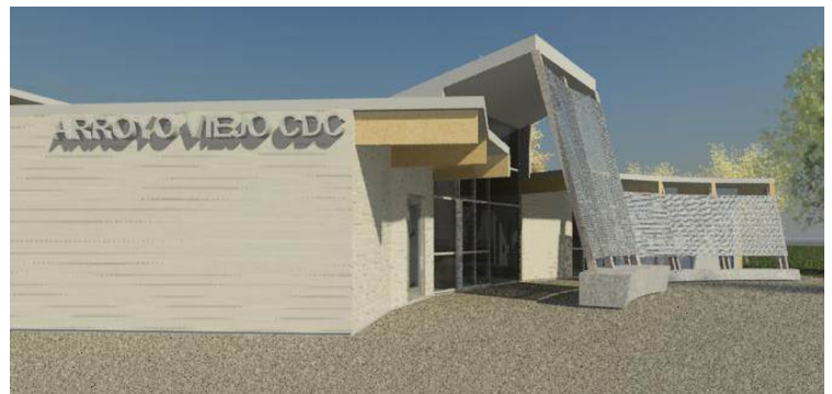
Arroyo Viejo CDC Renovation