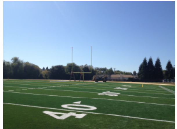
Madison Field Improvements (After)