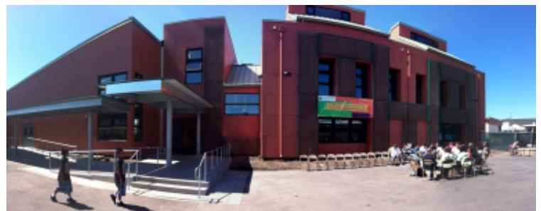
Highland Elementary School New Classroom & Cafeteria Building