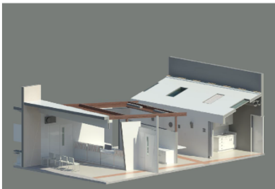
Havenscourt MS Health Center