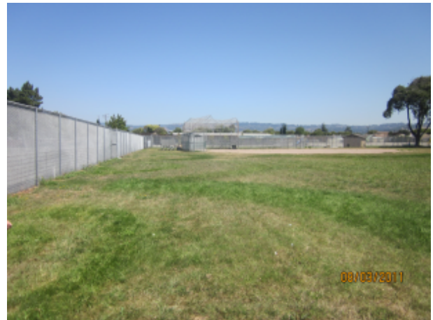
Madison Field Improvements (Before)