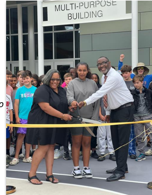
Bond Measures B, J, & Y New Multi-purpose, Cafeteria & Kitchen: Claremont MS, 2024