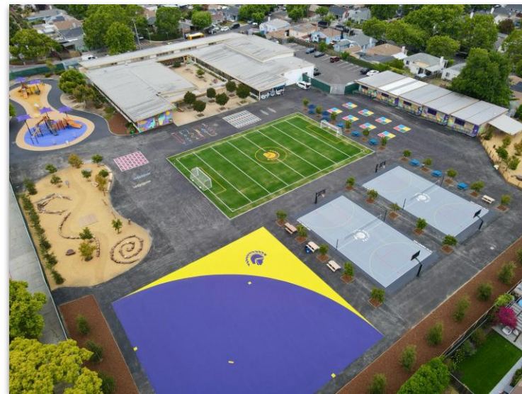
Living Schoolyard Project: Madison Park Academy Lower, 2025