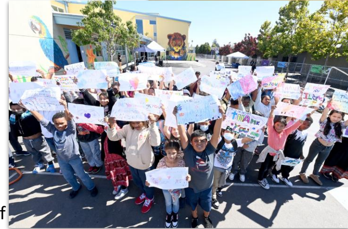
Students draw their ideal play areas during the Design phase