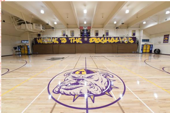
Oakland Tech HS