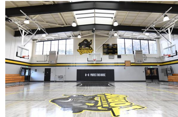
Gymnasium Upgrades: Montera HS, 2025