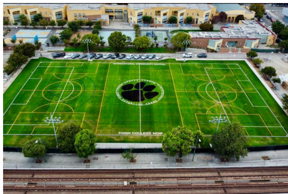
International Community School/Think College Now