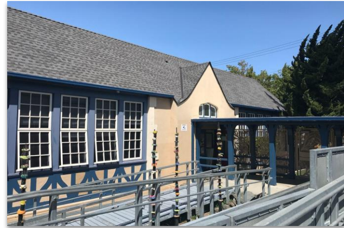
Deferred Maintenance Roof Replacement: Chabot ES, 2025