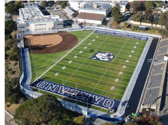
Turf Replacement: Oakland High, 2026