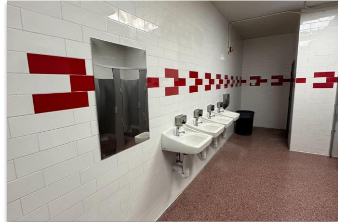
Deferred Maintenance Restroom Upgrades: Skyline HS, 2025