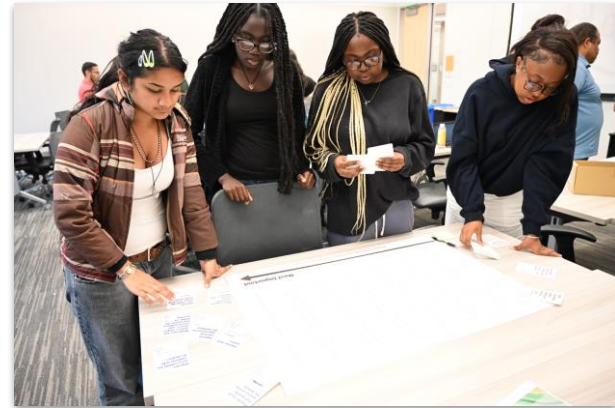
All City Council in action during a Facilities Master Plan Workshop