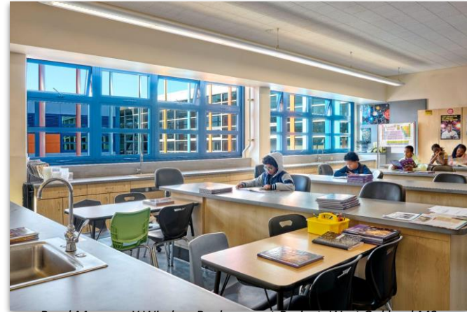
Bond Measure Y Window Replacement Project: West Oakland MS, 2025