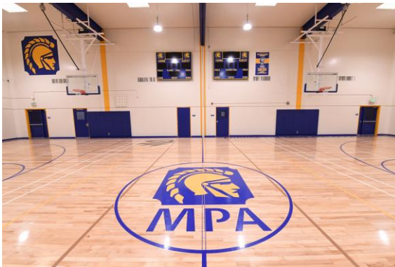
Madison Park Academy Upper