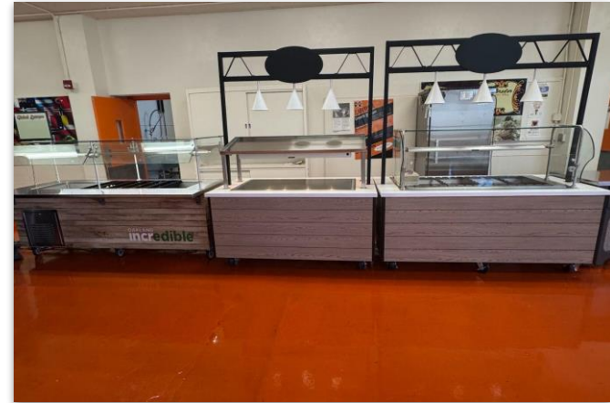
Cafeteria Upgrades: McClymonds HS, 2025