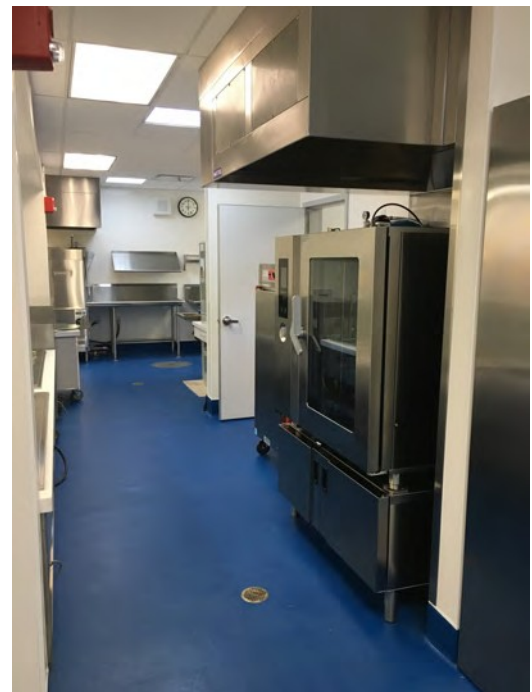
Completed Kaiser Multi-Purpose Room