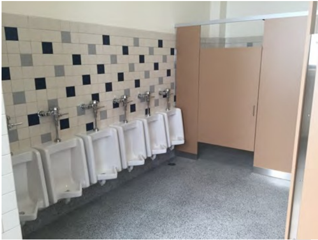
Fruitvale Restroom Renovation