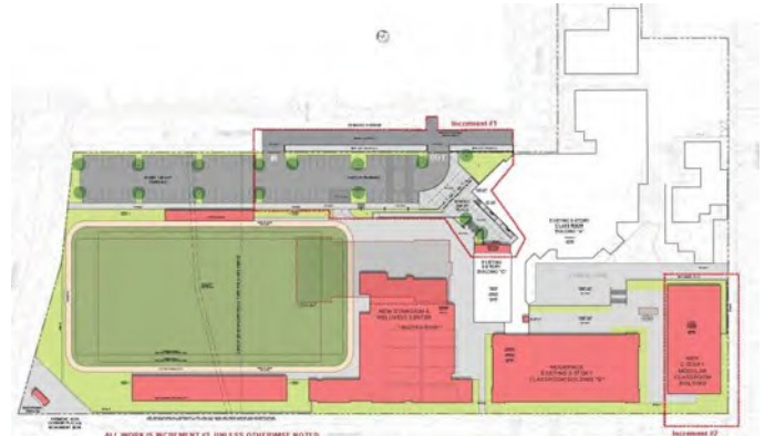
Fremont HS New Site Plan