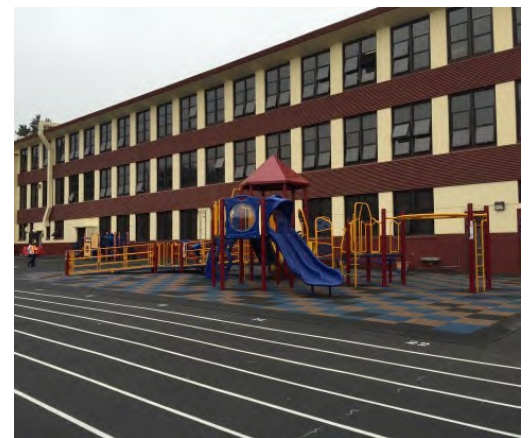
Bella Vista ES New Play Structure