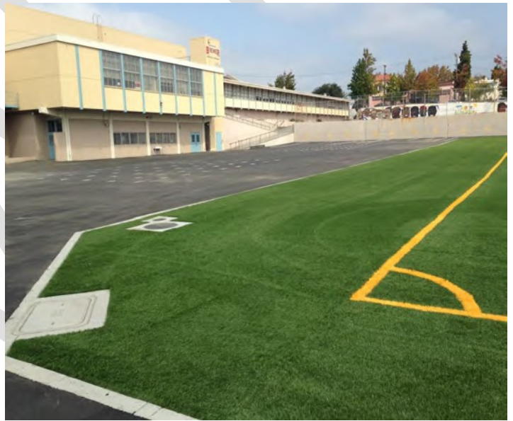
Edna Brewer Multi-Use Turf Field