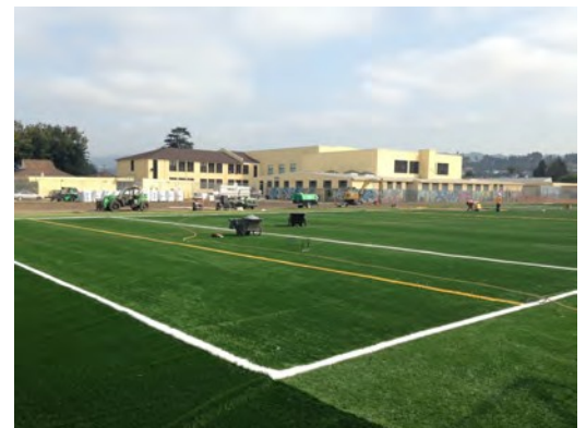
Elmhurst MS Turf Field