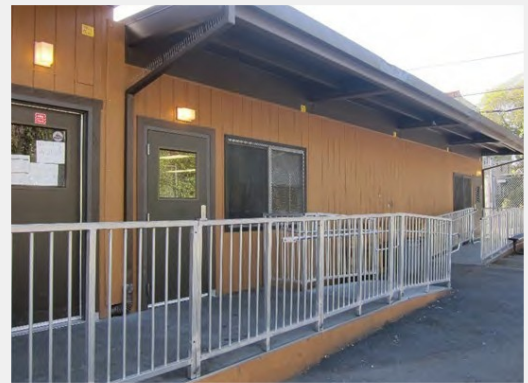
Existing Claremont Interim Kitchen

As part of the Rethinking School Lunch in Oakland initiative, the finishing kitchens are designed to prepare meals from bulk ingredients delivered by the new Central Kitchen. Currently each existing kitchen serves pre-packaged hot food delivered to the school. This new design will allow students the opportunity to have fresh prepared meals onsite. Each finishing kitchen at each site includes a fully equipped kitchen containing a servicing line, dry goods storage, tray wash area, food preparation area, staff restroom and custodial closet. Hot food will be prepared and served in the new kitchen and includes a full-service salad bar, fresh fruit, milk coolers and a hydration station.