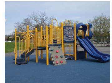
New Play Structure and Matting at Martin Luther King Jr. Elementary School