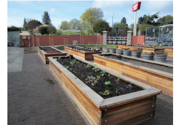
Planter Boxes at Claremont Middle School