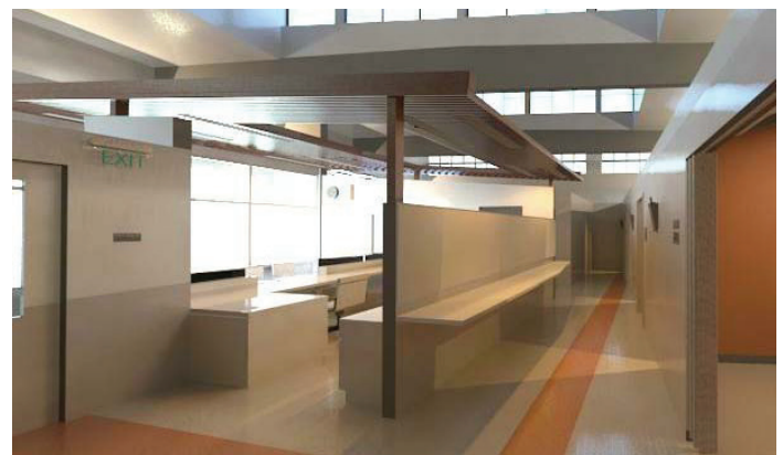
Interior Rendering of Health Center at Havenscourt Middle School