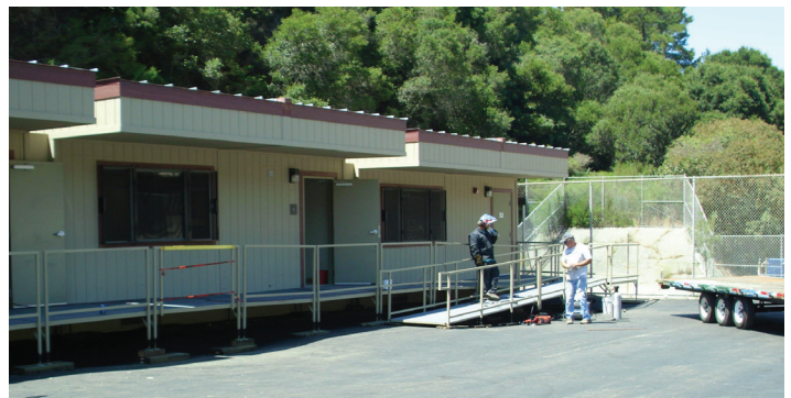
Interim Housing for New Two-Story Classroom Building at Montclair Elementary School