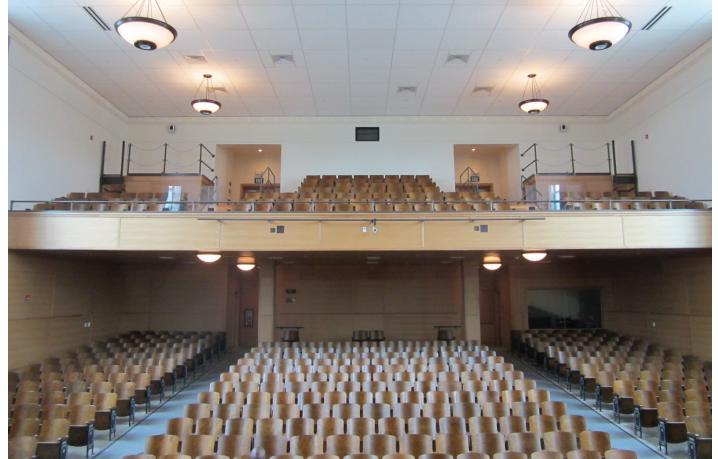
Restored Auditorium at Elmhurst Middle School

Additional scope was added on a site-specific basis. One of the more notable projects was the restored auditorium at Elmhurst Middle School.