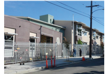
Portable Replacement Building at Jefferson Elementary School Left - Rendering, Right - Final Construction