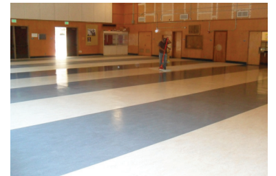
New Floor for Renovated Multi-Purpose Room at Montera Middle School