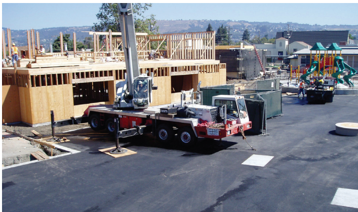
Construction of New Two-Story Classroom Building at Highland Elementary School