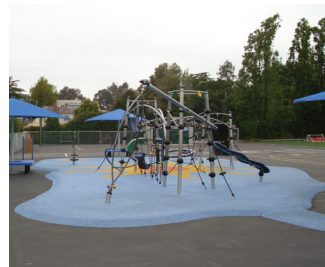
New Play Structure and Matting at Glenview Elementary School