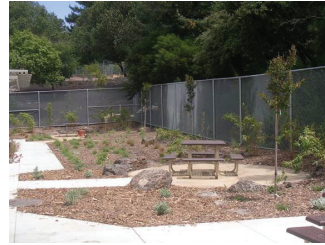
Landscaping Improvement at Chabot Elementary School