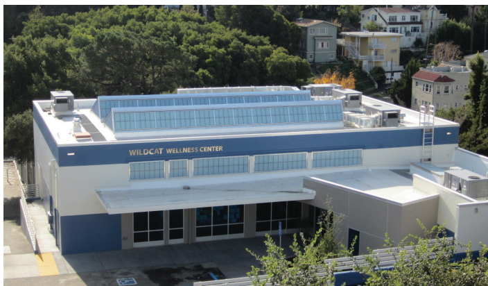
Wildcat Wellness Center SBHC at Oakland High School