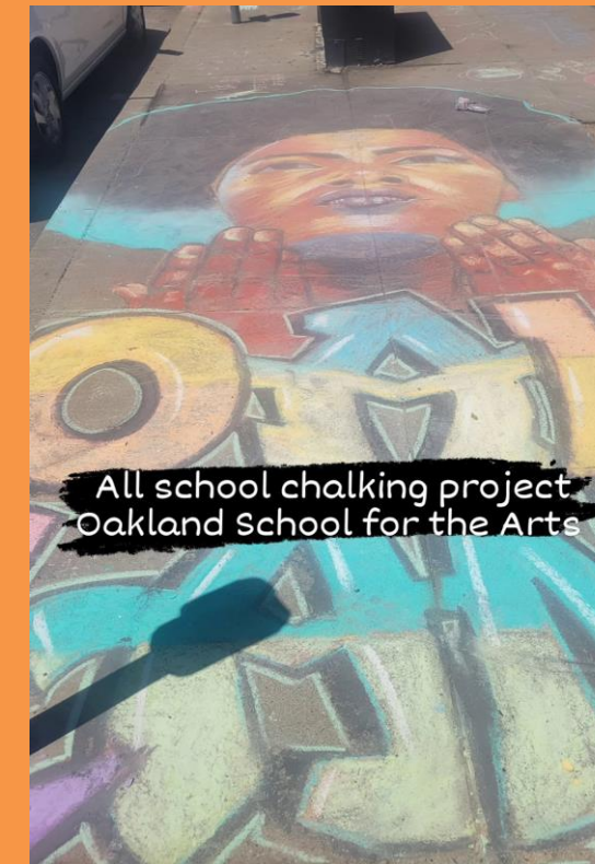
All school chalking project Oakland School for the Arts