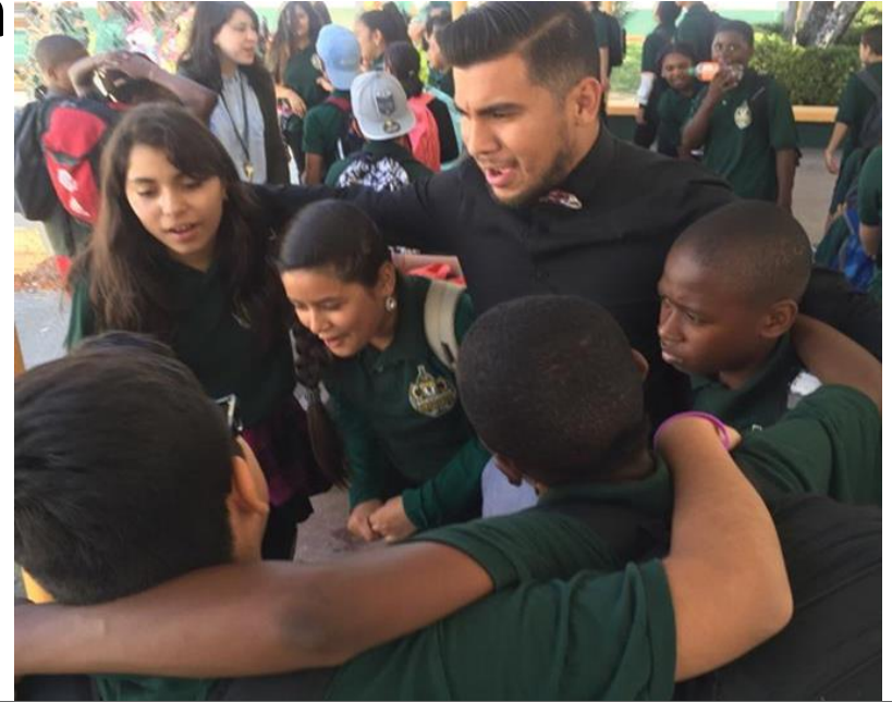
School Climate & Culture Plan