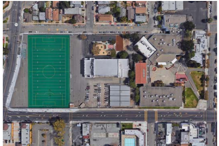
Future Site Schematic Design