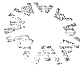
EXHIBIT A - SERVICES