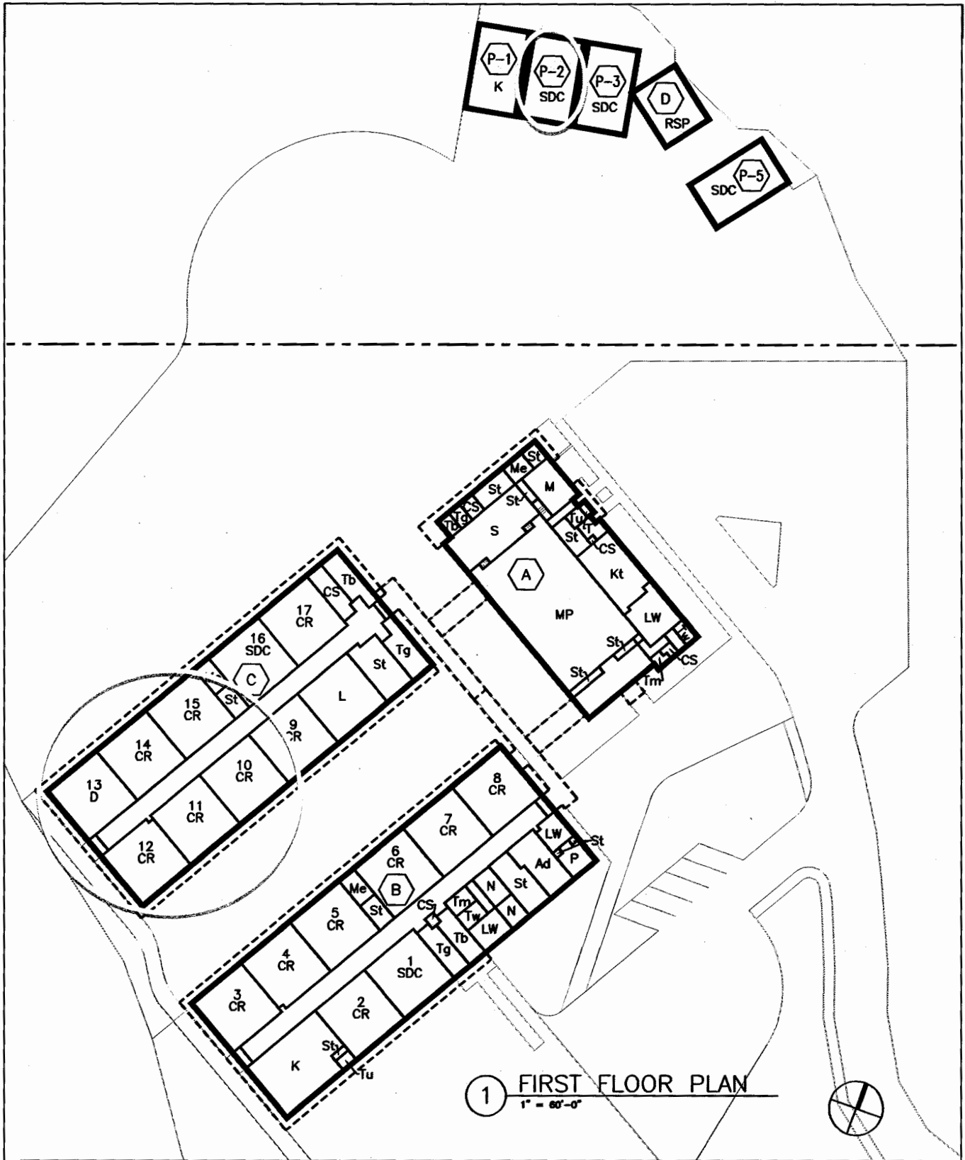
1 FIRST FLOOR PLAN 1" = 60'-0"