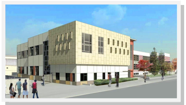
Future Two Story Classroom Building