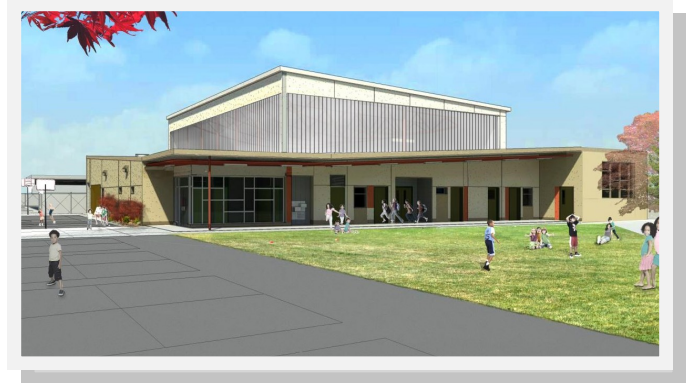
Future Multipurpose Building

Phase 2 of the grade expansion of Greenleaf Elementary School from K-5 to K-8 is construction of a new 14,646 square foot two story classroom building and a new 9,600 square foot multipurpose and flex classroom building. The new classroom building will be a high performance building featuring good lighting, clean air, and comfortable classrooms to create healthy learning environments for students. It will house offices and a library. Construction of the two buildings began in October 2015.