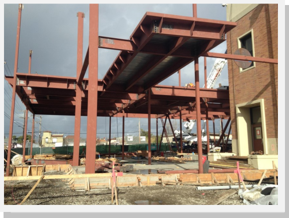
Construction of Two Story Classroom Building