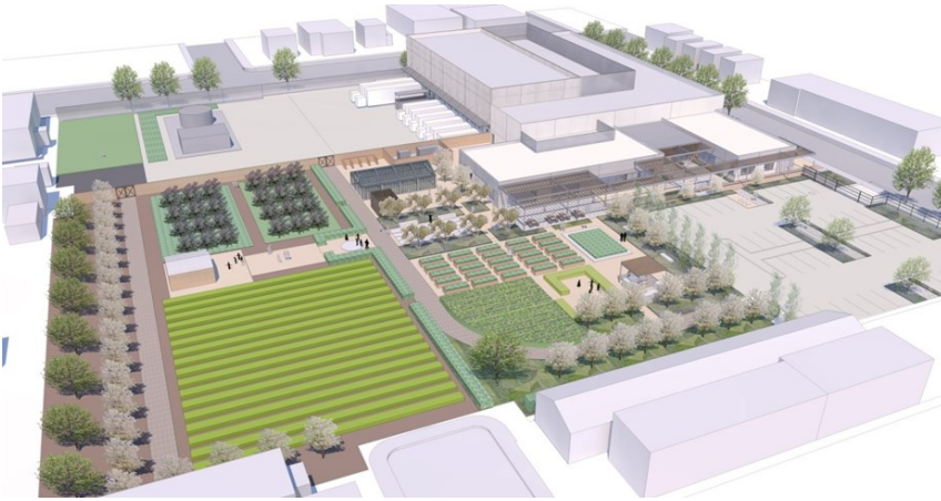
The Center: Central Kitchen and Education Center