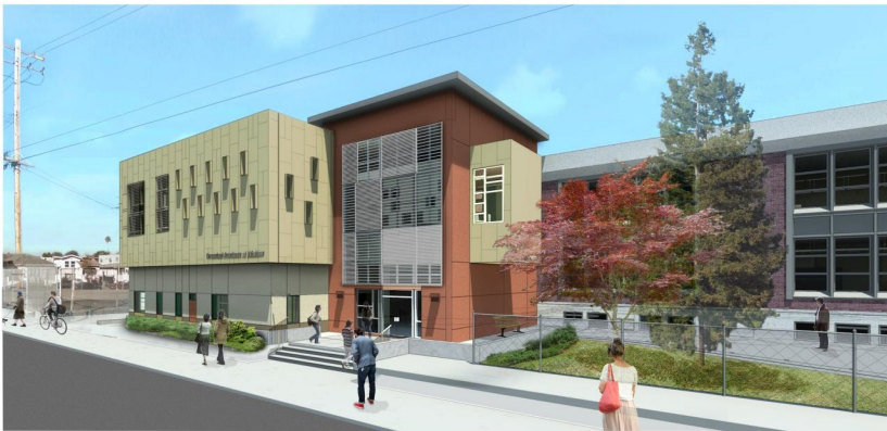
Greenleaf at Whittier Elementary School Campus Grade Expansion: New Two Story Classroom Building and Kinder Campus