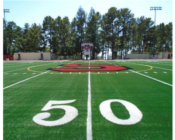
Skyline High School Turf Field Replacement