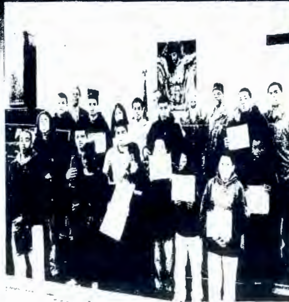
R.E.A.L. Choices Program Graduates