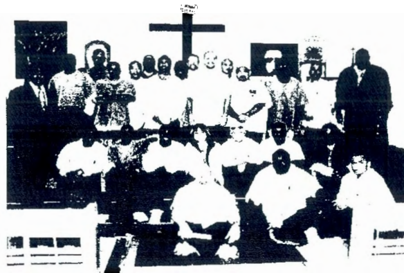
R.E.A.L. Choices San Quentin Facilitators

Our Facilitators are trained by acknowledged Subject Matter Experts in various aspects of juvenile development, thereby giving our dedicated men and women the tools they need to effectively deliver the REAL Choices Message