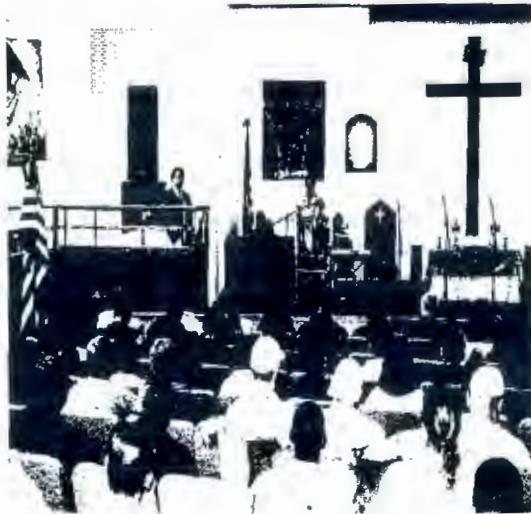
Program Graduation Ceremony

If the future is faced with intelligence and courage, history need not be repeated! In order for our youth to make informed decisions, they must be equipped with as much insight and as many useful tools as possible.