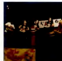
People United for a Better Life in Oakland building power, building change. » More