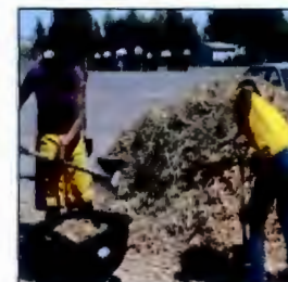
Oakland youth creating delicious and nutritious community gardens. » More