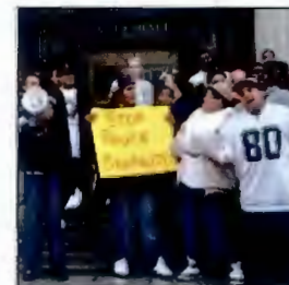
Advocating for more responsive and accountable police practices. » More

Home | About Us | News & Events | Report Police Abuse | Contact Us | Donate