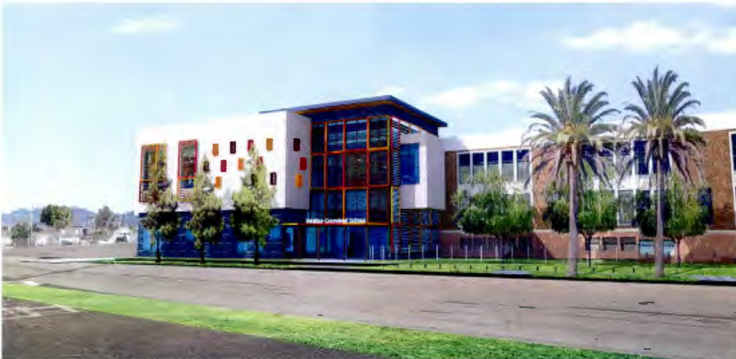
Conceptual Rendering of Site

Project Location 6328 E 17th Street Oakland, CA 94621