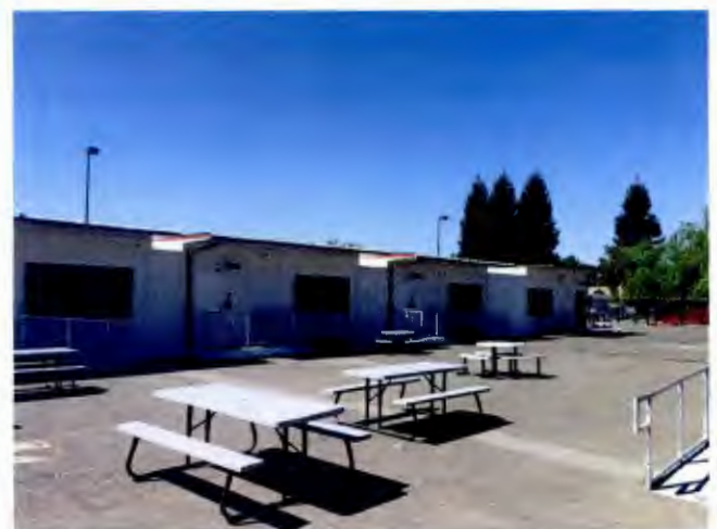
Current modular classroom buildings