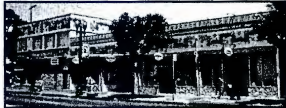
Before and after photos of a Fruitvale Business Improvement District façade Improvement