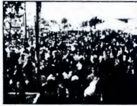
View from a music stage at the Día de los Muertos Festival

Throughout the year, the Unity Council hosts various special events in the Fruitvale community. The largest event, the Día de los Muertos Fruitvale Festival, celebrates life by remembering and honoring departed loved ones. The 2008 Festival drew more than 80,000 attendees from around the Bay Area and beyond. The Fruitvale Festival is the largest single-day Día de los Muertos event in the United States, and has been inducted by Congresswoman Barbara Lee into the United States Library of Congress as a "Local Legacy" for the State of California.