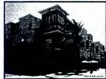
View of the Fruitvale Village

Completed in 2004, the Fruitvale Village is a transit oriented, mixed-use development located at the Bay Area Rapid Transit (BART) Fruitvale station. The goal of the Fruitvale Village is to revitalize the Fruitvale commercial corridor and link the community's thousands of daily commuters to neighborhood businesses and services. A model for urban redevelopment, this project supports a number of amenities including a commercial/retail shopping area, a large pedestrian plaza, and community services ranging from health care clinics to early childhood development centers. In addition, the Fruitvale Village houses a public library, ARISE High School, West Coast Children's Clinic, various community organizations, a senior center, and 47 units of housing. The developer of the project is the Fruitvale Development Corporation, a support corporation of the Unity Council.